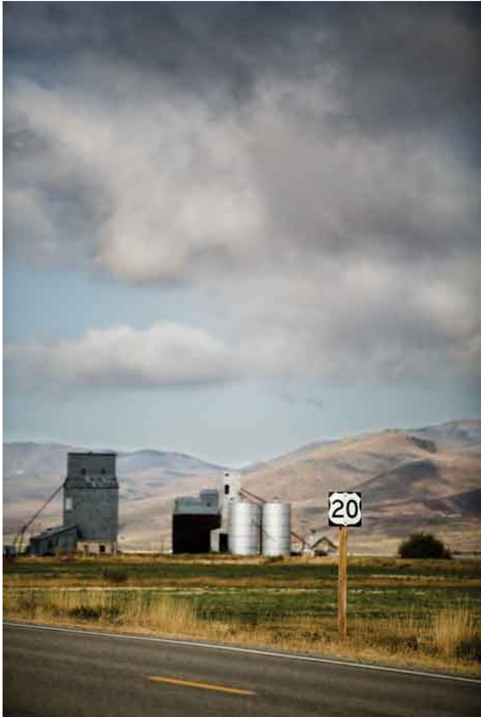
Grain silos—a fixture of the scenery along the way.