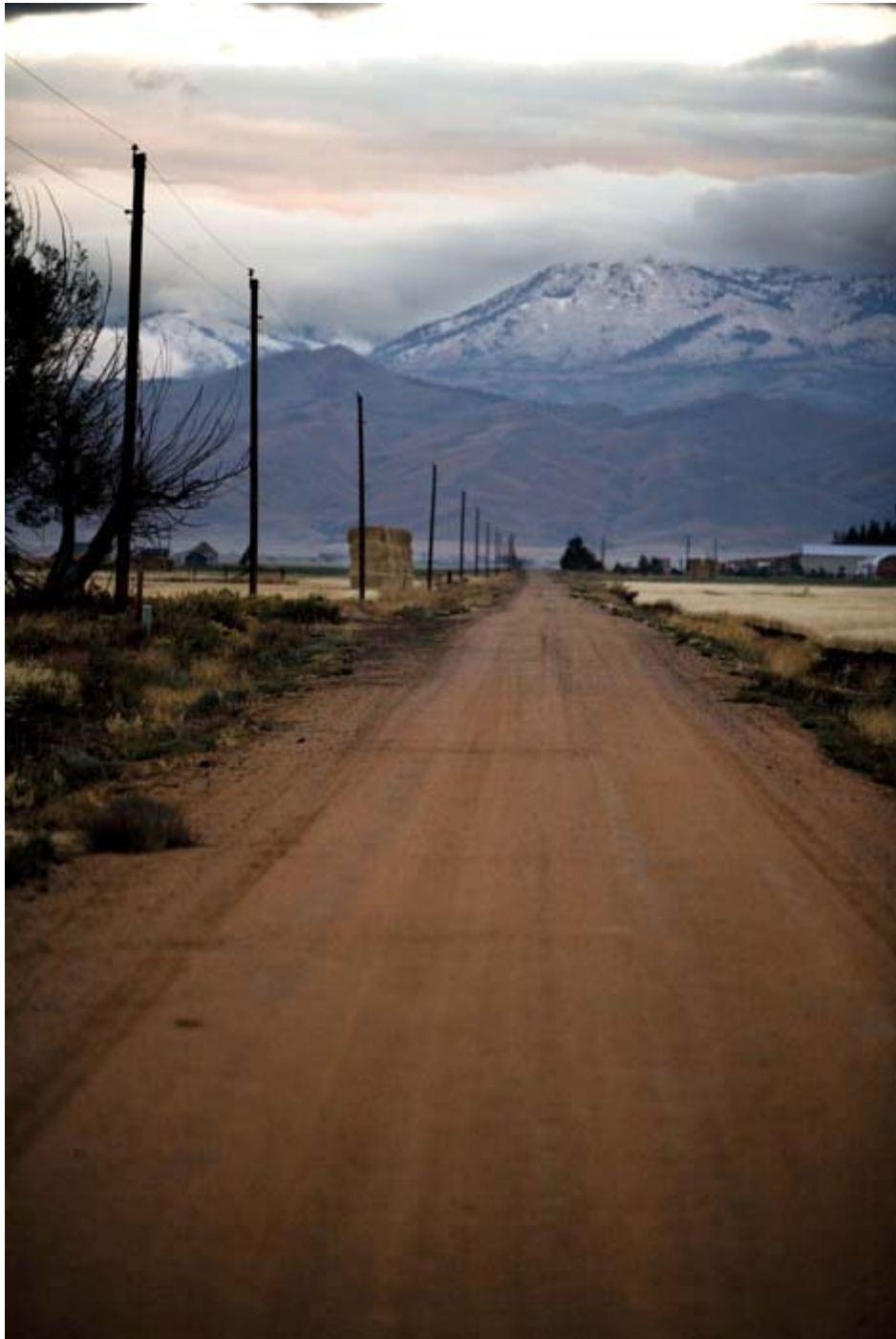
One of the many side roads along Highway 20 leading to farms on the Camas Prairie.