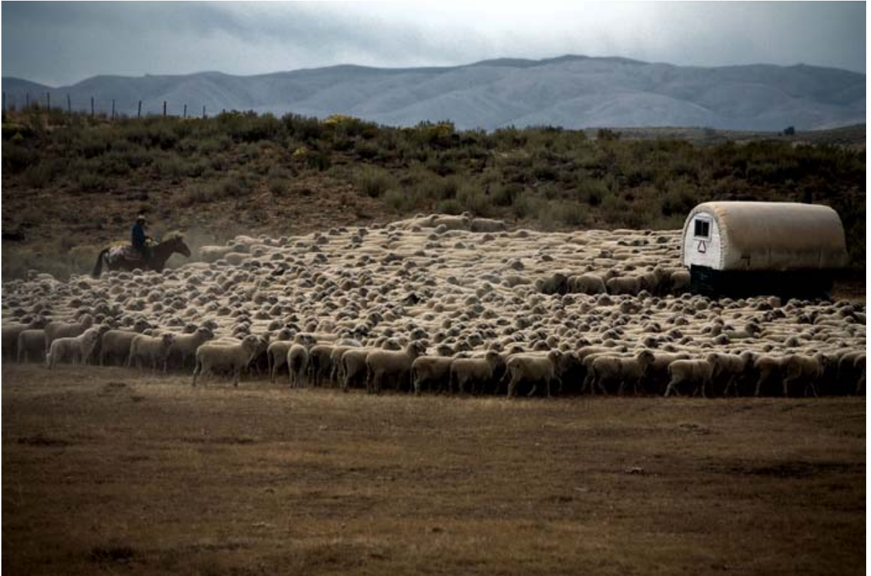
Shepherd moving sheep on the Camas Prairie.