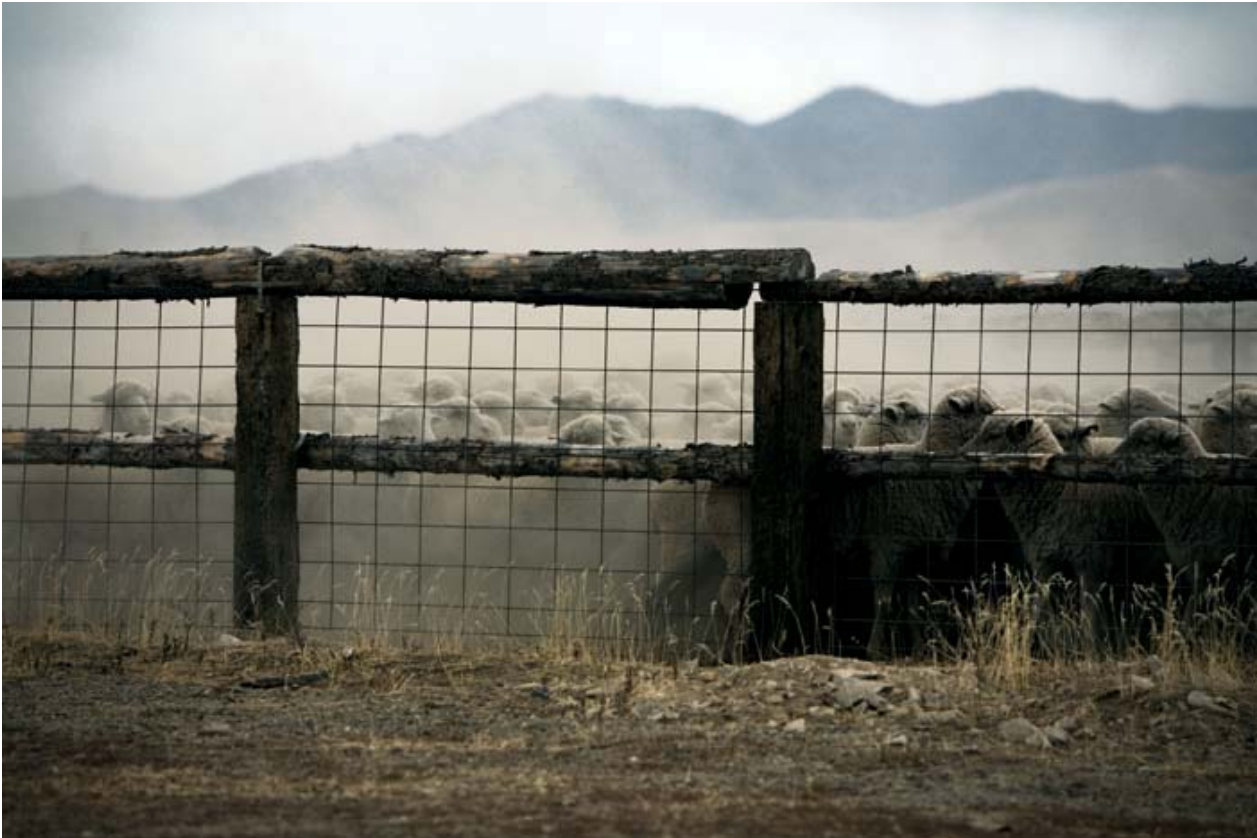
Shepherd moving sheep on the Camas Prairie.